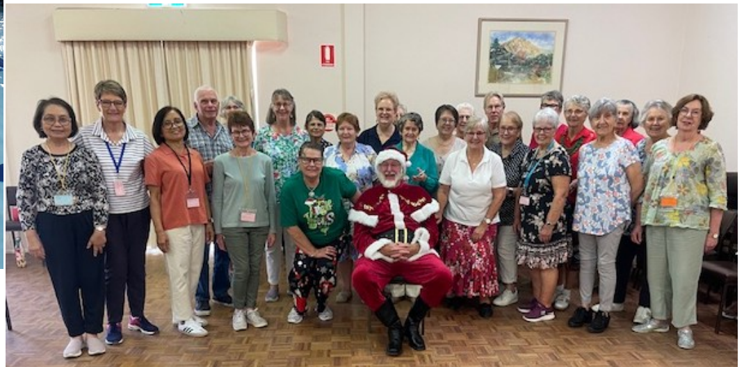
Line dancing troupe